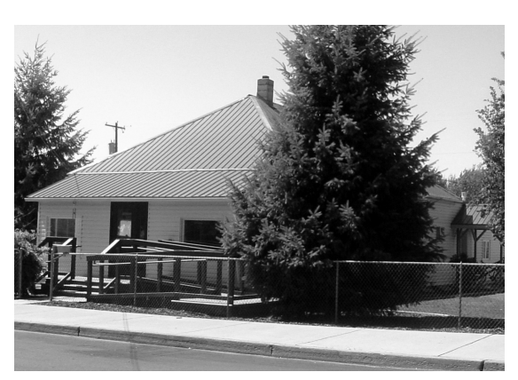
For more information about St. Vincent de Paul's Social Services, call 765-2064 or 664-3095.